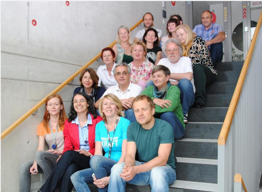
Team of the Institute of Biomedical Science

Thus, at the Institute of Biomedical Science education & research are combined with a high quality profile, state-of- the- art facilities and a strong scientific orientation.